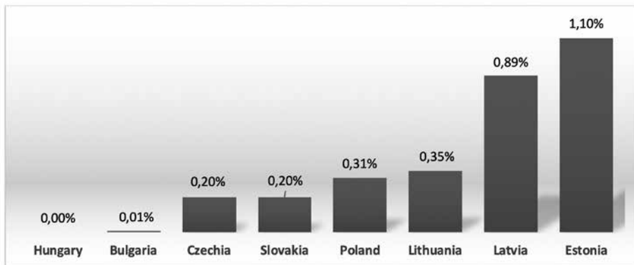
Figure 1 Government support (military commitments) to Ukraine - bilateral aid (% of GDP) in selected ex-communist countries in the period 24.01.2022-20.11.2022